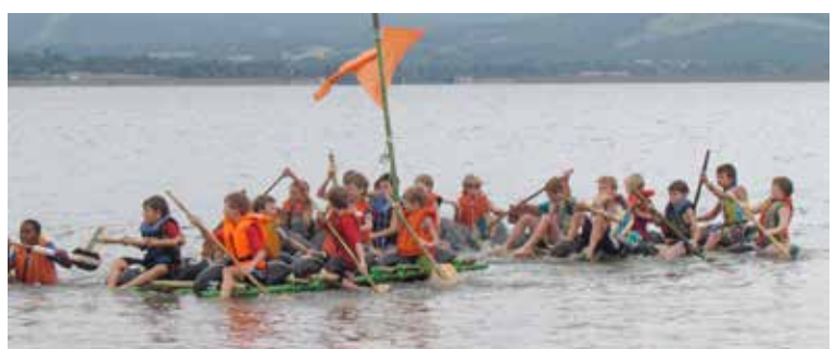
While the older cubs compete on their rafts.